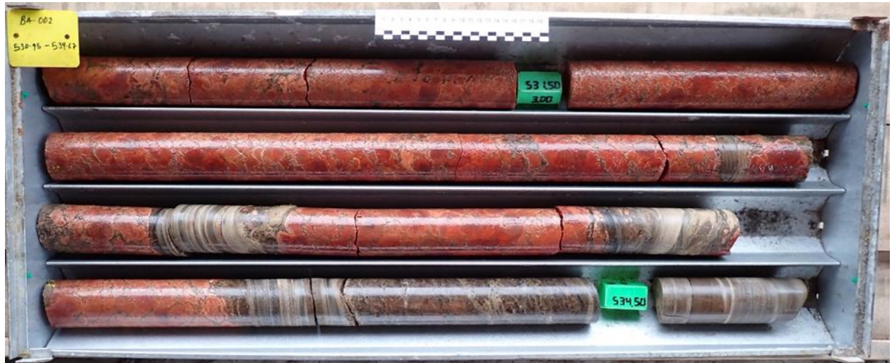
Fig. 3 Potash mineralization in drill core from BA-002 Extension showing nodular red carnallite with banded bedded halite attributed to Cycle III.

The Phase 1 drill program at Banio remains in progress with additional drilling planned at the North Target including the extension of BA-001 and the drilling of new hole BA-004. The drill rig experienced mechanical difficulties during the retrieval of PQ rods in BA-002 and is currently undergoing minor repairs. Drilling is expected to resume later in Q4, 2023.