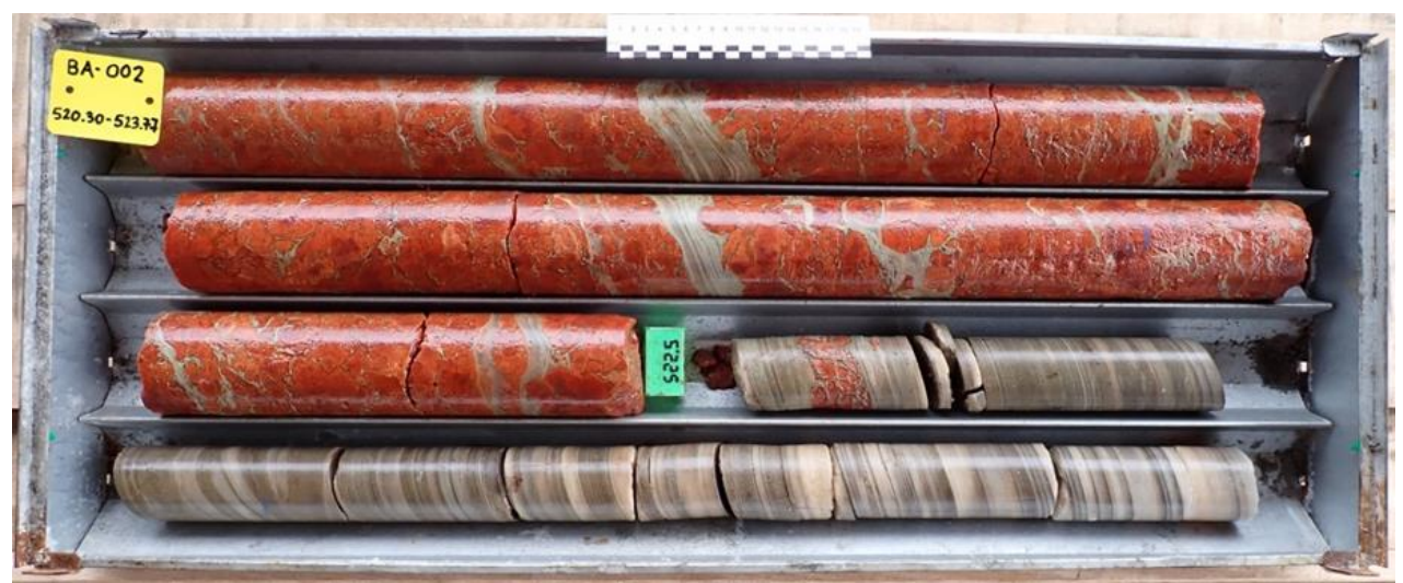
Fig. 2 Potash mineralization in drill core from BA-002 Extension showing nodular red carnallite and laminated halite attributed to Cycle IV (Hole Dip=90°).